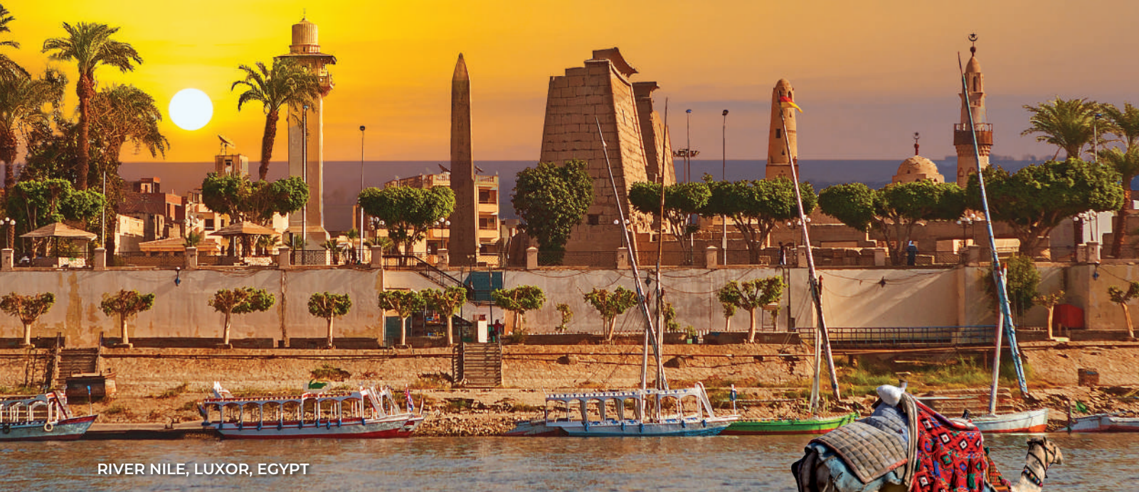
RIVER NILE, LUXOR, EGYPT