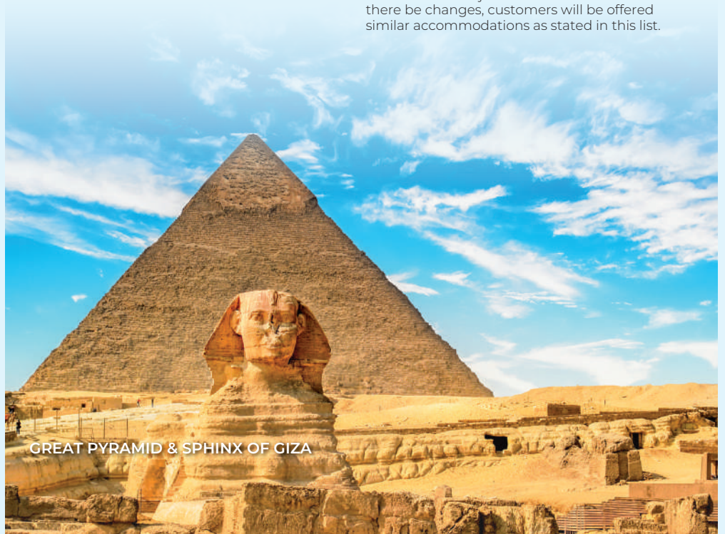
GREAT PYRAMID & SPHINX OF GIZA

*Note: Hotels subject to final confirmation. Should there be changes, customers will be offered similar accommodations as stated in this list.