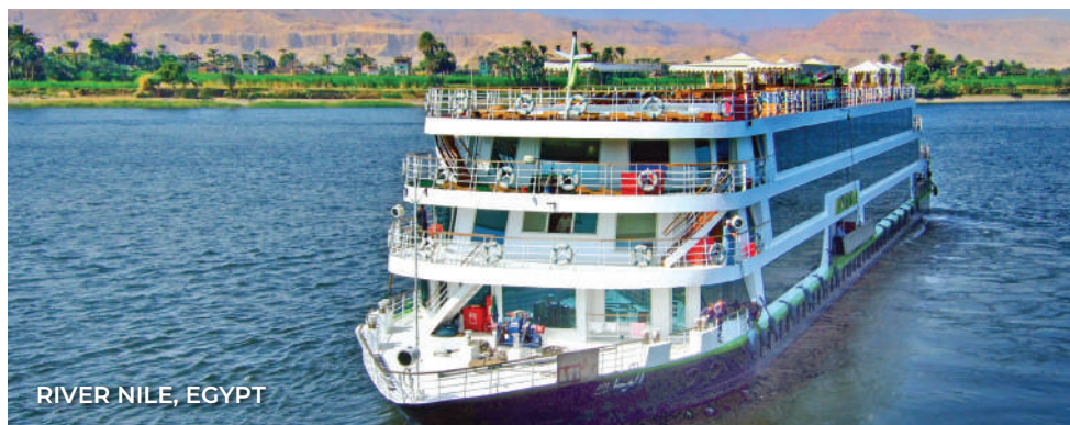
RIVER NILE, EGYPT